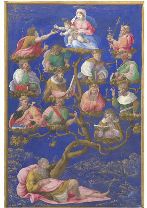
A Jesse Tree. Girolamo Genga: c. 1535. National Gallery, London. Layard Bequest, 1916.