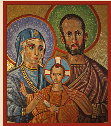
The Holy Family; St. Joseph's Chapel, Westminster Cathedral, London.

Sunday, December 10th, the 10 a.m. Mass will be a family Mass. We encourage everyone to attend with all your family so that we can pray together as a parish family, just as the Holy Family did in Nazareth. Afterwards, there will be Christmas cookies and coffee downstairs in the parish hall.