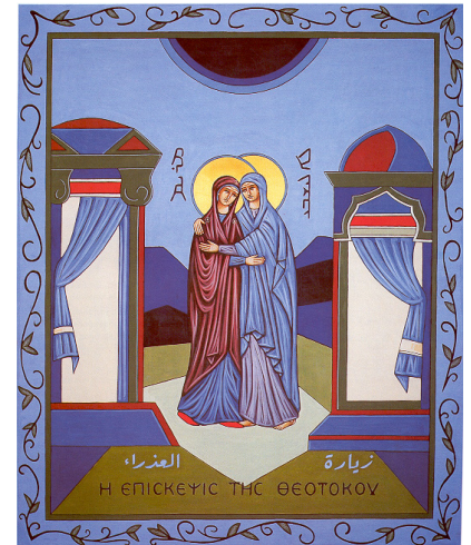
THE VISITATION. The Maronite Icons: Modern Sacred Art. Dar Sader Publishers: Beirut 1999.

During those days Mary set out and traveled to the hill country in haste to a town of Judah, where she entered the house of Zechariah and greeted Elizabeth. When Elizabeth heard Mary's greeting, the infant leaped in her womb, and Elizabeth, filled with the holy Spirit, cried out in a loud voice and said, "Most blessed are you among women, and blessed is the fruit of your womb. And how does this happen to me, that the mother of my Lord should come to me? For at the moment the sound of your greeting reached my ears, the infant in my womb leaped for joy. Blessed are you who believed that what was spoken to you by the Lord would be fulfilled."