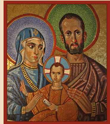
The Holy Family; St. Joseph's Chapel, Westminster Cathedral, London.

Sunday, December 10th, the 10 a.m. Mass will be a family Mass. We encourage everyone to attend with all your family so that we can pray together as a parish family, just as the Holy Family did in Nazareth. Afterwards, there will be Christmas cookies and coffee downstairs in the parish hall.