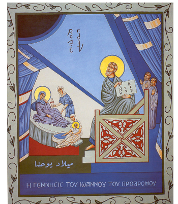
THE BIRTH OF JOHN THE BAPTIST. The Maronite Icons: Modern Sacred Art. Dar Sader Publishers: Beirut 1999.

Zechariah after his father. But his mother said, "No; he is to be called John." They said to her, "None of your relatives has this name." Then they began motioning to his father to find out what name he wanted to give him. He asked for a writing tablet and wrote, "His name is John." And all of them were amazed. Immediately his mouth was opened and his tongue freed, and he began to speak, praising God. Fear came over all their neighbors, and all these things were talked about throughout the entire hill country of Judea. All who heard them pondered them and said, "What then will this child become?" For, indeed, the hand of the Lord was with him.