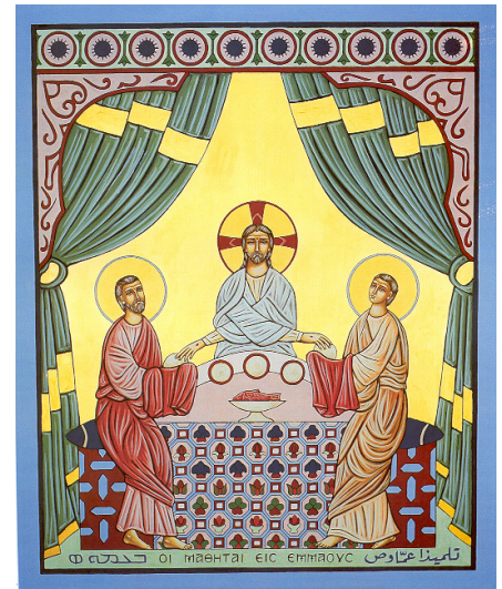
THE DISCIPLES OF EMMAUS. The Maronite Icons: Modern Sacred Art. Dar Sader Publishers: Beirut 1999.

Now that very day two of them were going to a village seven miles from Jerusalem called Emmaus, and they were conversing about all the things that had occurred. And it happened that while they were conversing and debating, Jesus himself drew near and walked with them, but their eyes were prevented from recognizing him. He asked them, "What are you discussing as you walk along?" They stopped, looking downcast. One of them, named Cleopas, said to him in reply, "Are you the only visitor to Jerusalem who does not know of the things that have taken place there in these days?" And he replied to them, "What sort of things?" They said to him, "The things that happened to Jesus the Nazarene, who was a prophet mighty in deed and word before God and all the people, how our chief priests and rulers both handed him over to a sentence of death and crucified him. But we were hoping that he would be the one to redeem Israel; and besides all this, it is now the third day since this took place. Some women from our group, however, have astounded us: they were at the tomb early in the morning and did not find his body; they came back and reported that they had indeed seen a vision of angels who announced that he was