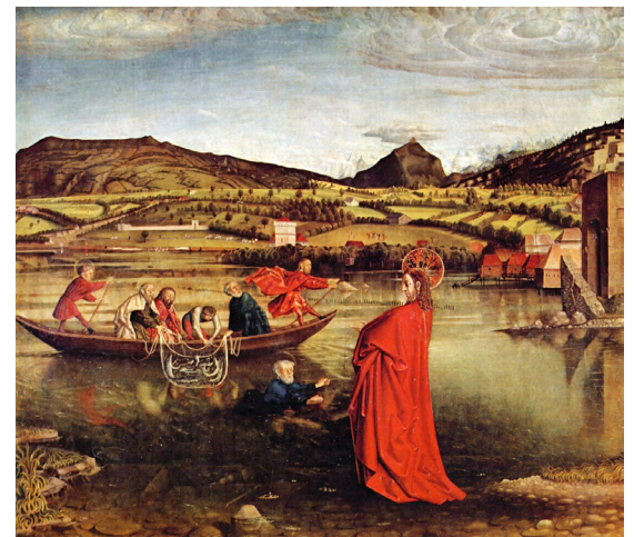
THE MIRACULOUS DRAUGHT OF FISHES BY KONRAD WITZ, 1444. Musée d'Art et d'Histoire de Genève.

The other disciples came in the boat, for they were not far from shore, only about a hundred yards, dragging the net with the fish. When they climbed out on shore, they saw a charcoal fire with fish on it and bread. Jesus said to them, "Bring some of the fish you just caught." So