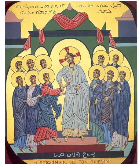
OUR LORD APPEARS TO THOMAS. The Maronite Icons: Modern Sacred Art. Dar Sader Publishers: Beirut 1999.

and put it into my side, and do not be unbelieving, but believe." Thomas answered and said to him, "My Lord and my God!" Jesus said to him, "Have you come to believe because you have seen me? Blessed are those who have not seen and have believed." Now Jesus did many other signs in the presence of (his) disciples that are not written in this book. But these are written that you may (come to) believe that Jesus is the Messiah, the Son of God, and that through this belief you may have life in his name.