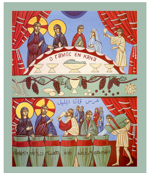
THE MIRACLE AT CANA. The Maronite Icons: Modern Sacred Art. Dar Sader Publishers: Beirut 1999. Via Maronite Heritage.com/icons

On the third day there was a wedding in Cana in Galilee, and the mother of Jesus was there. Jesus and his disciples were also invited to the wedding. When the wine ran short, the mother of Jesus said to him, "They have no wine." (And) Jesus said to her, "Woman, how does your concern affect me? My hour has not yet come." His mother said to the servers, "Do whatever he tells you." Now there were six stone water jars there for Jewish ceremonial washings, each holding twenty to thirty gallons. Jesus told them, "Fill the jars with water." So they filled them to the brim. Then he told them, "Draw some out now and take it to the headwaiter." So they took it. And when the headwaiter tasted the water that had become wine, without knowing where it came from (although the servers who had drawn the water knew), the headwaiter called the bridegroom and said to him, "Everyone serves good wine first, and then when people have drunk freely, an inferior one; but you have kept the good wine until now." Jesus did this as the beginning of his signs in Cana in Galilee and so revealed his glory, and his disciples began to believe in him. This is the Truth. Peace be with you.