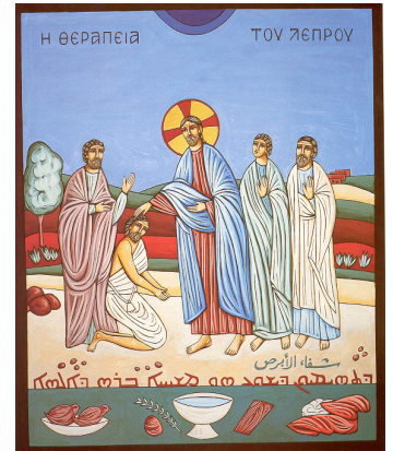
THE HEALING OF THE LEPER. The Maronite Icons: Modern Sacred Art. Dar Sader Publishers: Beirut 1999. Via Maronite Heritage.com/icons

Rising very early before dawn, he left and went off to a deserted place, where he prayed. Simon and those who were with him pursued him and on finding him said, "Everyone is looking for you." He told them, "Let us go on to the nearby villages that I may preach there also. For this purpose have I come." So he went into their synagogues, preaching and driving out demons throughout the whole of Galilee. A leper came to him (and kneeling down) begged him and said, "If you wish, you can make me clean." Moved with pity, he stretched out his hand, touched him, and said to him, "I do will it. Be made clean." The leprosy left him immediately, and he was made clean. Then, warning him sternly, he dismissed him at once. This is the Truth. Peace be with you.