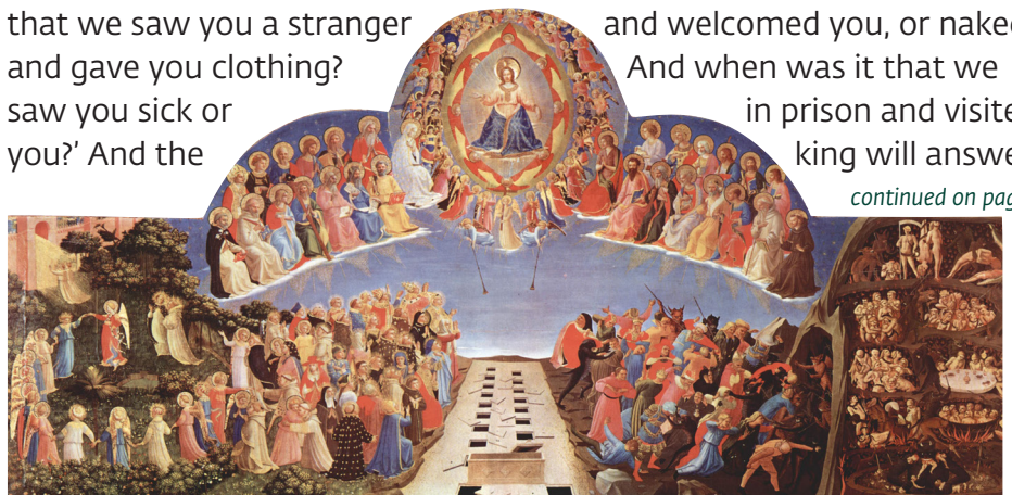
The Last Judgment (Tempera on panel. Between 1425-1431) Fra Angelico. Originally in the church of Santa Maria degli Angeli; now in the museum of San Marco, Florence.

This week Father will pray the ANAPHORA OF SAINT PETER, beginning on page 774.