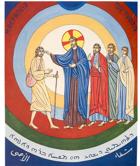
THE HEALING OF BARTIMAEUS THE BLIND The Maronite Icons: Modern Sacred Art. Dar Sader Publishers: Beirut 1999.

They came to Jericho. And as he was leaving Jericho with his disciples and a sizable crowd, Bartimaeus, a blind man, the son of Timaeus, sat by the roadside begging. On hearing that it was Jesus of Nazareth, he began to cry out and say, "Jesus, son of David, have pity on me." And many rebuked him, telling him to be silent. But he kept calling out all the more, "Son of David, have pity on me." Jesus stopped and said, "Call him." So they called the blind man, saying to him, "Take courage; get up, he is calling you." He threw aside his cloak, sprang up, and came to Jesus. Jesus said to him in reply, "What do you want me to do for you?" The blind man replied to him, "Master, I want to see." Jesus told him, "Go your way; your faith has saved you." Immediately he received his sight and followed him on the way. This is the Truth. Peace be with you.