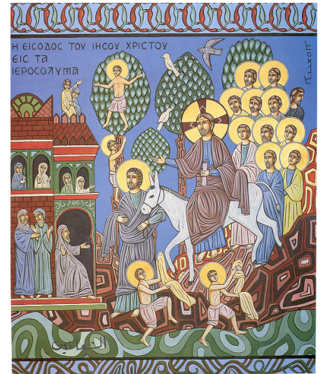
HOSANNA SUNDAY The Maronite Icons: Modern Sacred Art. Dar Sader Publishers: Beirut 1999.

On the next day, when the great crowd that had come to the feast heard that Jesus was coming to Jerusalem, they took palm branches and went out to meet him, and cried out: "Hosanna! Blessed is he who comes in the name of the Lord, (even) the king of Israel." Jesus found an ass and sat upon it, as is written: "Fear no more, O daughter Zion; see, your king comes, seated upon an ass's colt." His disciples did not understand this at first, but when Jesus had been glorified they remembered that these things were written about him and that they had done this for him. So the crowd that was with him when he called Lazarus from the tomb and raised him from death continued to testify. This was (also) why the crowd went to meet him, because they heard that he had done this sign. So the Pharisees said to one another, "You see that you are gaining nothing. Look, the whole world has gone after him." Now there were some Greeks among those who had come up to worship at the feast. They came to Philip, who was from Bethsaida in Galilee, and asked him, "Sir, we would like to see Jesus." Philip went and told Andrew; then Andrew and Philip went and told Jesus. This is the Truth. Peace be with you.