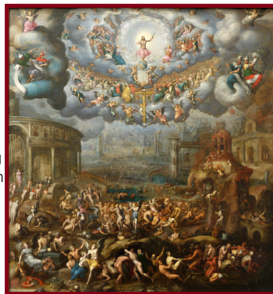
THE LAST JUDGEMENT. Jehan Cousin the Younger, c. 1585. The Louvre.

If anyone says to you then, 'Look, here is the Messiah!' or, 'There he is!' do not believe it. False messiahs and false prophets will arise, and they will perform signs and wonders so great as to deceive, if that were possible, even the elect. Behold, I have told it to you beforehand. So if they say to you, 'He is in the desert,' do not go out there; if they say, 'He is in the inner rooms,' do not believe it. For just as lightning comes from the east and is seen as far as the west, so will the coming of the Son of Man be. Wherever the corpse is, there the vultures will gather. "Immediately after the tribulation of those days, the sun will be darkened, and the moon will not give its light, and the stars will fall from the sky, and the powers of the heavens will be shaken. And then the sign of the Son of Man will appear in heaven, and all the tribes of the earth will mourn, and they will see the Son of Man coming upon the clouds of heaven with power and great glory. And he will send out his angels with a trumpet blast, and they will gather his elect from the four winds, from one end of the heavens to the other.