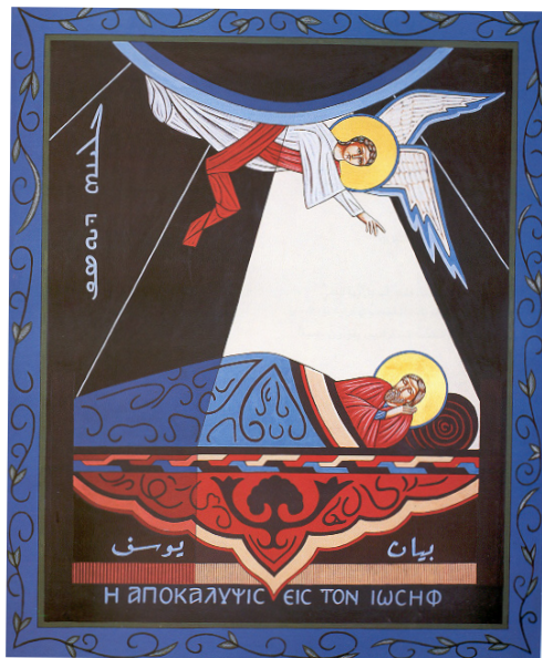
THE REVELATION TO JOSEPH The Maronite Icons: Modern Sacred Art. Dar Sader Publishers: Beirut 1999.

with child from the Holy Spirit. Her husband Joseph, being a righteous man and unwilling to expose her to public disgrace, planned to dismiss her quietly. But just when he had resolved to do this, an angel of the Lord appeared to him in a dream and said, "Joseph, son of David, do not be afraid to take Mary as your wife, for the child conceived in her is from the Holy Spirit. She will bear a son, and you are to name him Jesus, for he will save his people from their sins." All this took place to fulfill what had been spoken by the Lord through the prophet: "Look, the virgin shall conceive and bear a son, and they shall name him Emmanuel," which means, "God is with us." When Joseph awoke from sleep, he did as the angel of the Lord commanded him; he took her as his wife, but had no marital relations with her until she had borne a son; and he named him Jesus. This is the truth. Peace be with you.