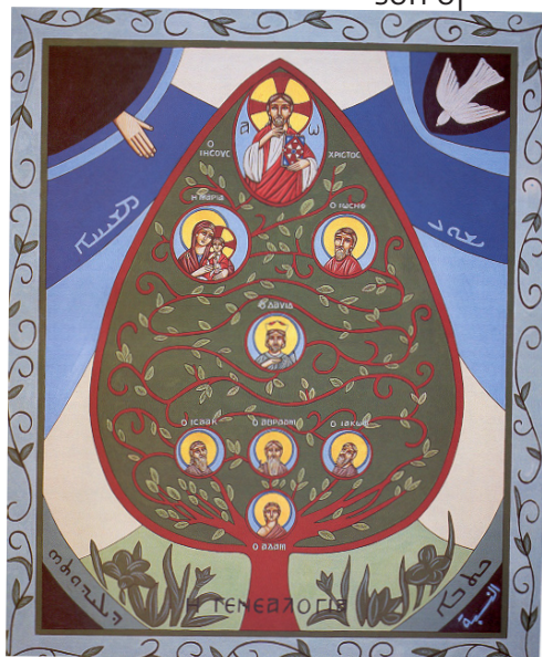
THE GENEALOGY OF OUR LORD The Maronite Icons: Modern Sacred Art. Dar Sader Publishers: Beirut 1999.

Isaac, and Isaac the father of Jacob, and Jacob the father of Judah and his brothers, and Judah the father of Perez and Zerah by Tamar, and Perez the father of Hezron, and Hezron the father of Aram, and Aram the father of Aminadab, and Aminadab the father of Nahshon, and Nahshon the father of Salmon, and Salmon the father of Boaz by Rahab, and Boaz the father of Obed by Ruth, and Obed the father of Jesse, and Jesse the father of King David. And David was the father of Solomon by the wife of Uriah, and Solomon the father of Rehoboam, and Rehoboam the father of Abijah, and Abijah the father of Asaph, and Asaph the father of Jehoshaphat, and Jehoshaphat the father of Joram, and Joram the father of Uzziah, and Uzziah the father of Jotham, and Jotham the father of Ahaz, and Ahaz the father of Hezekiah, and Hezekiah the father of Manasseh, and Manasseh the father of Amos, and Amos the