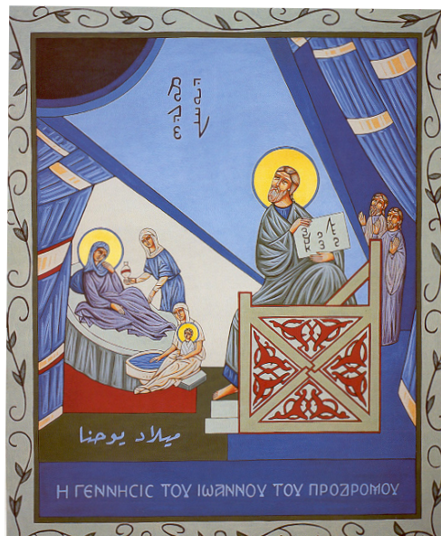
THE BIRTH OF JOHN THE BAPTIST. The Maronite Icons: Modern Sacred Art. Dar Sader Publishers: Beirut 1999.

the Lord had shown his great mercy to her, and they rejoiced with her. On the eighth day they came to circumcise the child, and they were going to name him Zechariah after his father. But his mother said, "No; he is to be called John." They said to her, "None of your relatives has this name." Then they began motioning to his father to find out what name he wanted to give him. He asked for a writing tablet and wrote, "His name is John." And all of them were amazed. Immediately his mouth was opened and his tongue freed, and he began to speak, praising God. Fear came over all their neighbors, and all these things were talked about throughout the entire hill country of Judea. All who heard them pondered them and said, "What then will this child become?" For, indeed, the hand of the Lord was with him. This is the truth. Peace be with you.