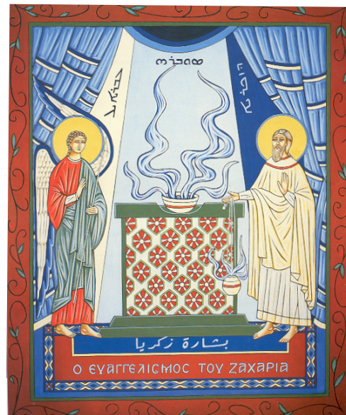
THE ANNOUNCEMENT TO ZECHARIAH. The Maronite Icons: Modern Sacred Art. Dar Sader Publishers: Beirut 1999.

In the days of King Herod of Judea, there was a priest named Zechariah, who belonged to the priestly order of Abijah. His wife was a descendant of Aaron, and her name was Elizabeth. Both of them were righteous before God, living blamelessly according to all the commandments and regulations of the Lord. But they had no children, because Elizabeth was barren, and both were getting on in years. Once when he was serving as priest before God and his section was on duty, he was chosen by lot, according to the