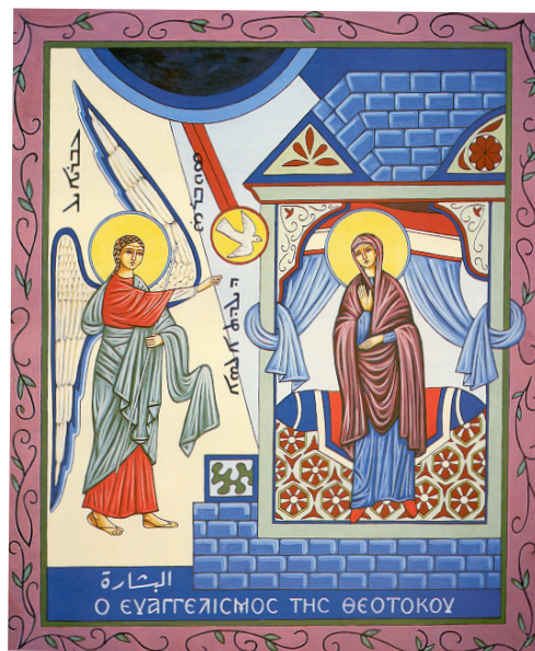
THE ANNUNCIATION. The Maronite Icons: Modern Sacred Art. Dar Sader Publishers: Beirut 1999.

And now, you will conceive in your womb and bear a son, and you will name him Jesus. He will be great, and will be called the Son of the Most High, and the Lord God will give to him the throne of his ancestor David. He will reign over the house of Jacob forever, and of his kingdom there will be no end." Mary said to the angel, "How can this be, since I am a virgin?" The angel said to her, "The Holy Spirit will come upon you, and the power of the Most High will overshadow you; therefore the child to be born will be holy; he will be called Son