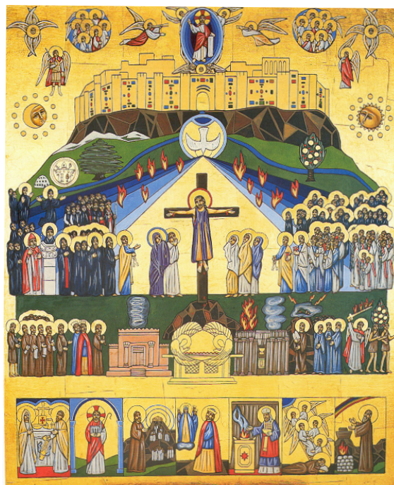
THE CONSECRATION OF THE CHURCH. The Maronite Icons: Modern Sacred Art. Dar Sader Publishers: Beirut 1999.

said, "Some say John the Baptist, but others Elijah, and still others Jeremiah or one of the prophets." He said to them, "But who do you say that I am?" Simon Peter answered, "You are the Messiah, the Son of the living God." And Jesus answered him, "Blessed are you, Simon son of Jonah! For flesh and blood has not revealed this to you, but my Father in heaven. And I tell you, you are Peter, and on this rock I will build my church, and the gates of Hades will not prevail against it. I will give you the keys of the kingdom of heaven, and whatever you bind on earth will be bound in heaven, and whatever you loose on earth will be loosed in heaven." Then he sternly ordered the disciples not to tell anyone that he was the Messiah. This is the truth. Peace be with you.