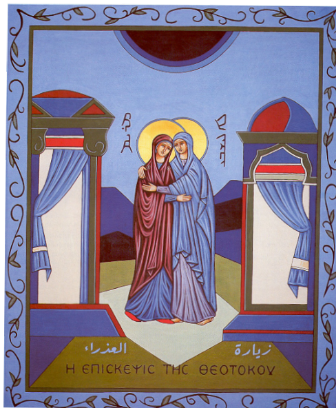
THE VISITATION. The Maronite Icons: Modern Sacred Art. Dar Sader Publishers: Beirut 1999.

During those days Mary set out and traveled to the hill country in haste to a town of Judah, where she entered the house of Zechariah and greeted Elizabeth. When Elizabeth heard Mary's greeting, the infant leaped in her womb, and Elizabeth, filled with the holy Spirit, cried out in a loud voice and said, "Most blessed are you among women, and blessed is the fruit of your womb. And how does this happen to me, that the mother of my Lord should come to me? For at the moment the sound of your greeting reached my ears, the infant in my womb leaped for joy. Blessed are you who believed that what was spoken to you by the Lord would be fulfilled."