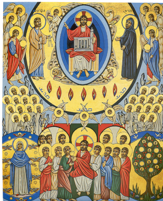
THE DEDICATION OF THE CHURCH. The Maronite Icons: Modern Sacred Art. Dar Sader Publishers: Beirut 1999.

My Father, who has given them to me, is greater than all, and no one can take them out of the Father's hand. The Father and I are one." The Jews again picked up rocks to stone him. Jesus answered them, "I have shown you many good works from my Father. For which of these are you trying to