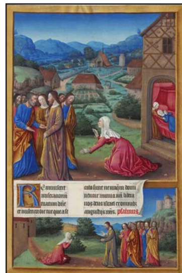
THE CANANNITE WOMAN IN LES TRÈS RICHES HEURES DU DUC DE BERRY, Folio 164r. Painted by the Limbourg brothers between 1412 -1416. Musée Condé Chantilly, Oise.

Then Jesus went from that place and withdrew to the region of Tyre and Sidon. And behold, a Canaanite woman of that district came and called out, "Have pity on me, Lord, Son of David! My daughter is tormented by a demon." But he did not say a word in answer to her. His disciples came and asked him, "Send her away, for she keeps calling out after us." He said in reply, "I was sent only to the lost sheep of the house of Israel." But the woman came and did him homage, saying, "Lord, help me." He said in reply, "It is not right to take the food of the children and throw it to the dogs." She said, "Please, Lord, for even the dogs eat the scraps that fall from the table of their masters." Then Jesus said to her in reply, "O woman, great is your faith! Let it be done for you as you wish." And her daughter was healed from that hour.