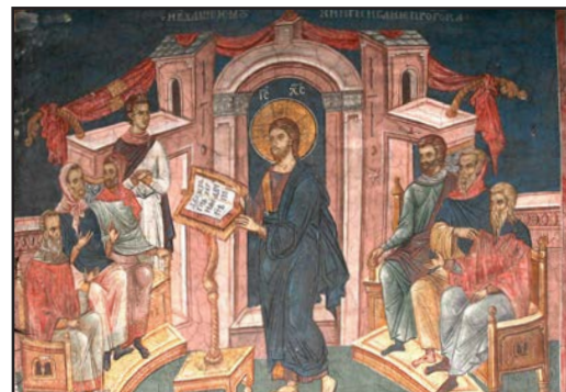
JESUS READING IN THE SYNAGOGUE. Fresco from the Serbian Orthodox Monastery Visoki Decani

synagogue on the sabbath day. He stood up to read and was handed a scroll of the prophet Isaiah. He unrolled the scroll and found the passage where it was written: "The Spirit of the Lord is upon me, because he has anointed me to bring glad tidings to the poor. He has sent me to proclaim liberty to captives and recovery of sight to the blind, to let the oppressed go free, and to proclaim a year acceptable to the Lord." Rolling up the scroll, he handed it back to the attendant and sat down, and the eyes of all in the synagogue looked intently at him. He said to them, "Today this scripture passage is fulfilled in your hearing."