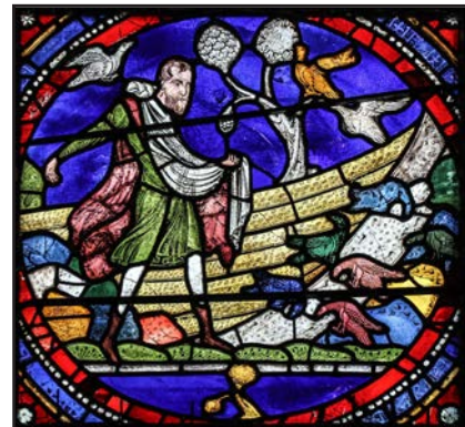
THE PARABLE OF THE SOWER. Stained glass window from Canterbury Cathedral via Flickr

The theme of this week's Gospel: The Word of God is like seed: it is productive, and abundant, and its fruitfulness depends on our heart, our will, and our response.