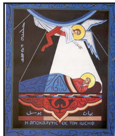
THE REVELATION TO JOSEPH. The Maronite Icons: Modern Sacred Art. Dar Sader Publishers: Beirut 1999.

but before they lived together, she was found to be with child from the Holy Spirit. Her husband Joseph, being a righteous man and unwilling to expose her to public disgrace, planned to dismiss her quietly. But just when he had resolved to do this, an angel of the Lord appeared to him in a dream and said, "Joseph, son of David, do not be afraid to take Mary as your wife, for the child conceived in her is from the Holy Spirit. She will bear a son, and you are to name him Jesus, for he will