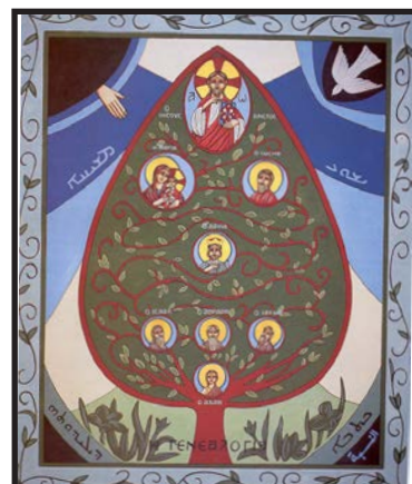
THE REVELATION TO JOSEPH. The Maronite Icons: Modern Sacred Art. Dar Sader Publishers: Beirut 1999.

Abraham was the father of Isaac, and Isaac the father of Jacob, and Jacob the father of Judah and his brothers, and Judah the father of Perez and Zerah by Tamar, and Perez the father of Hezron, and Hezron the father of Aram, and Aram the father of Aminadab, and Aminadab the father of Nahshon, and Nahshon the father of Salmon, and Salmon the father of Boaz by Rahab, and Boaz the father of Obed by Ruth, and Obed the father of Jesse, and Jesse the father of King David. And David was the father of