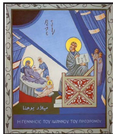
THE BIRTH OF JOHN THE BAPTIST The Maronite Icons: Modern Sacred Art. Dar Sader Publishers: Beirut 1999.

Now the time came for Elizabeth to give birth, and she bore a son. Her neighbors and relatives heard that the Lord had shown his great mercy to her, and they rejoiced with her. On the eighth day they came to circumcise the child, and they were going to name him Zechariah after his father. But his mother said, "No; he is to be called John." They said to her, "None of your relatives has this name." Then they began motioning to his father to find out what name he wanted to give him. He asked for a writing tablet and wrote, "His name is John." And all of them were amazed. Immediately his mouth was opened and his tongue freed, and he began to speak, praising God. Fear came over all their neighbors, and