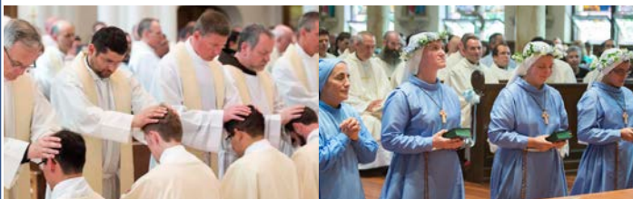
St. John Vianney Theological Seminary May 2017

My Good and Beloved Father, direct our children to be open to Your will. Keep them in the palm of Your hand. Send Your Spirit to guide them in their decision to serve all men for Your sake. Bestow Your graces upon our young men and women who desire to serve You wholeheartedly. May Your will be done in their precious lives. Amen.