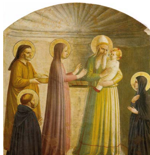
THE PRESENTATION AT THE TEMPLE

Guided by the Spirit, Simeon came into the temple; and when the parents brought in the child Jesus, to do for him what was customary under the law, Simeon took him in his arms and praised God, saying, "Master, now you are dismissing your servant in peace, according to your word; for my eyes have seen your salvation, which you have prepared in the presence of all peoples,