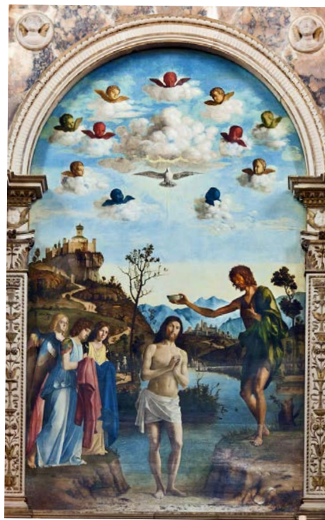
THE BAPTISM OF CHRIST.

world! This is he of whom I said, 'After me comes a man who ranks ahead of me because he was before me.' I myself did not know him; but I came baptizing with water for this reason, that he might be revealed to Israel." And John testified, "I saw the Spirit descending from heaven like a dove, and it remained on him. I myself did not know him, but the one who sent me to baptize with water said to me, 'He on whom you see the Spirit descend and remain is the one who baptizes with the Holy Spirit.' And I myself have seen and have testified that this is the Son of God." This is the truth. Peace be with you.