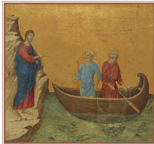
Duccio di Buoninsegna. The Calling of the Apostles Peter and Andrew (c. 1308 - 1311)

The two disciples heard him say this, and they followed Jesus. When Jesus turned and saw them following, he said to them, "What are you looking for?" They said to him, "Rabbi" (which translated means Teacher), "where are you staying?" He said to them, "Come and see." They came and saw where he was staying, and they remained with him that day. It was about four o'clock in the afternoon. One of the two who heard John speak and followed him was Andrew, Simon Peter's brother. He first found his brother Simon and said to him, "We have found the Messiah" (which is translated Anointed). He brought Simon to Jesus, who looked at him and said, "You are Simon son of John. You are to be called Cephas" (which is translated Peter). This is the truth. Peace be with you.