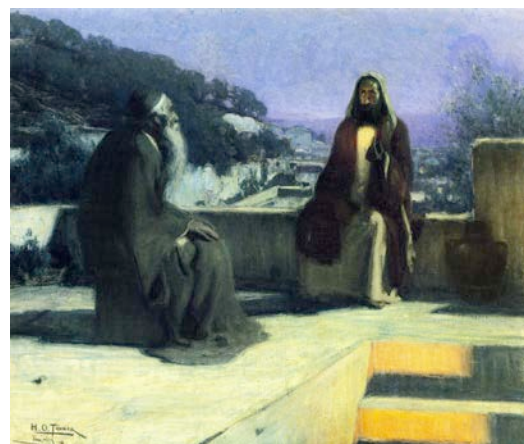
JESUS AND NICODEMUS by Henry Ossawa Tanner, 1899

enter the kingdom of God without being born of water and Spirit. What is born of the flesh is flesh, and what is born of the Spirit is spirit. Do not be astonished that I said to you, 'You must be born from above.' The wind blows where it chooses, and you hear the sound of it, but you do not know where it comes from or where it goes. So it is with everyone who is born of the Spirit." Nicodemus said to him, "How can these things be?" Jesus answered him, "Are you a teacher of Israel, and yet you do not