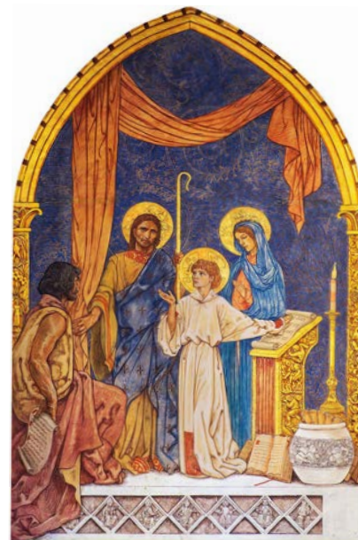
FINDING THE CHRIST CHILD IN THE TEMPLE, THE FIFTH JOYFUL MYSTERY OF THE ROSARY.

Now every year his parents went to Jerusalem for the festival of the Passover. And when he was twelve years old, they went up as usual for the festival. When the festival was ended and they started to return, the boy Jesus stayed behind in Jerusalem, but his parents did not know it. Assuming that he was in the group of travelers, they went a day's journey. Then they started to look for him among their relatives and friends. When they did not find him, they returned to Jerusalem to search for him. After three days they found him in the temple, sitting among the teachers, listening to them and asking them questions. And all who heard him were amazed at his understanding and his answers. When his parents saw him they were astonished; and his mother said to him, "Child, why have you treated us like this? Look, your father and I have been searching for you in great anxiety." He said to them, "Why were you searching for me? Did you not know that I must be in my Father's house?" But they did not understand what he said to them. Then he went down with them and came to Nazareth, and was obedient to them. His mother treasured all these things in her heart. And Jesus increased in wisdom and in years, and in divine and human favor.