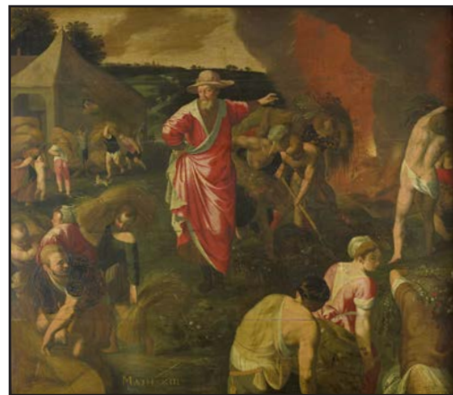
PARABLE OF THE WEEDS AMONG THE WHEAT Isaac van Swanenburg c. 1590-1610. The Rijksmuseum, Amsterdam.

The Apostle Matthew writes: Then, dismissing the crowds, Jesus went into the house. His disciples approached him and said, "Explain to us the parable of the weeds in the field." He said in reply, "He who sows good seed is the Son of Man, the field is the world, the good seed the children of the kingdom. The weeds are the children of the evil one, and the enemy who sows them is the devil. The harvest is the end of the age, and the harvesters are angels. Just as weeds are collected and burned up with fire, so will it be at the end of the age. The Son of Man will send his angels, and they will collect out of his kingdom all who cause others to sin and all evildoers. They will throw them into the fiery furnace,