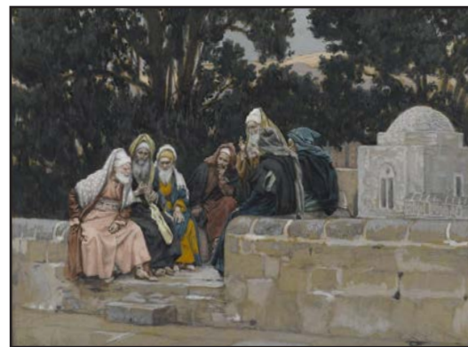
THE PHARISEES AND THE HERODIANS CONSPIRE AGAINST JESUS (LES PHARISIENS ET LES HÉRODIENS CONSPIRENT CONTRE JÉSUS) From the series LA VIE DE NOTRE-SEIGNEUR JÉSUS-CHRIST 1886-1894 by James Tissot. The Brooklyn Museum.

Isaiah the prophet: "Behold, my servant whom I have chosen, my beloved in whom I delight; I shall place my spirit upon him, and he will proclaim justice to the Gentiles. He will not contend or cry out, nor will anyone hear his voice in the streets. A bruised reed he will not break, a smoldering wick he will not quench, until he brings justice to victory. And in his name the Gentiles will hope."