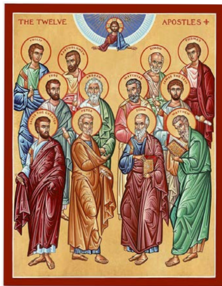
ICON OF THE TWELVE APOSTLES.

Then he summoned his twelve disciples and gave them authority over unclean spirits to drive them out and to cure every disease and every illness. The names of the twelve apostles are these: first, Simon called Peter, and his brother Andrew; James, the son of Zebedee, and his brother John; Philip and Bartholomew, Thomas and Matthew the tax collector; James, the son of Alphaeus, and Thaddeus; Simon the Cananean, and Judas Iscariot who betrayed him. Jesus sent out these twelve after instructing them thus, "Do not go into pagan territory or enter a Samaritan town. Go rather to the lost sheep of the house of Israel. As you go, make this proclamation: 'The kingdom of heaven is at hand.' This is the truth. Peace be with you.