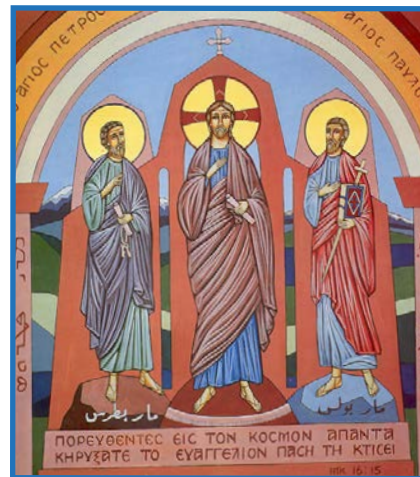
SAINTS PETER AND PAUL The Maronite Icons: Modern Sacred Art. Dar Sader Publishers: Beirut 1999.

When Jesus went into the region of Caesarea Philippi he asked his disciples, "Who do people say that the Son of Man is?" They replied, "Some say John the Baptist, others Elijah, still others Jeremiah or one of the prophets." He said to them, "But who do you say that I am?" Simon Peter said in reply, "You are the Messiah, the Son of the living God." Jesus said to him in reply, "Blessed are you, Simon son of Jonah. For flesh and blood has not revealed this to you, but my heavenly Father. And so I say to you, you are Peter, and upon this rock I will build my church, and the gates of the netherworld shall not prevail against it. I will give you the keys to the kingdom of heaven. Whatever you bind on earth shall be bound in heaven; and whatever you loose on earth shall be loosed in heaven." Then he strictly ordered his disciples to tell no one that he was the Messiah. This is the truth. Peace be with you.