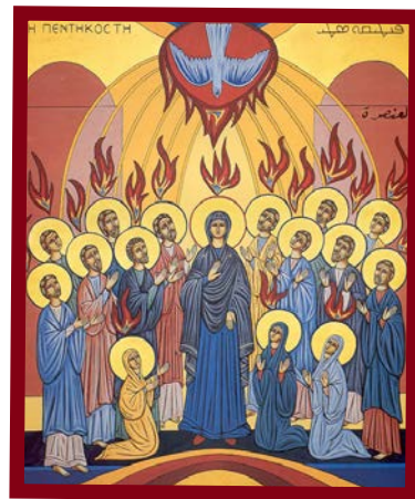
PENTECOST The Maronite Icons: Modern Sacred Art. Dar Sader Publishers: Beirut 1999.

"If you love me, you will keep my commandments. And I will ask the Father, and he will give you another Advocate to be with you always, the Spirit of truth, which the world cannot accept, because it neither sees nor knows it. But you know it, because it remains with you, and will be in you. I will not leave you orphans; I will come to you. In a little while the world will no longer see me, but you will see me, because I live and you will live. On that day you will realize that I am in my Father and you are in me and I in you."