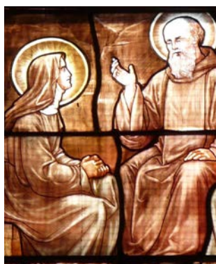
Detail of St. Benedict and Saint Scholastica. Stained glass (1876) in the church of St. Suplice du Bugue, Dordogne, France.

I asked you and you would not listen; so, I asked my God and He did listen. -- St Scholastica