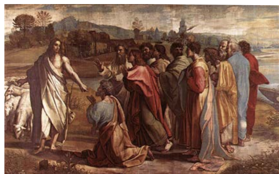
CHRIST'S CHARGE TO PETER One of ten cartoons produced by Raphael between 1515 - 1516 for a set of tapestries commissioned by Pope Leo X for the Sistine Chapel Victoria & Albert Museum, London

to him, "Tend my sheep." He said to him the third time, "Simon, son of John, do you love me?" Peter was distressed that he had said to him a third time, "Do you love me?" and he said to him, "Lord, you know everything; you know that I love you." (Jesus) said to him, "Feed my sheep. Amen, amen, I say to you,