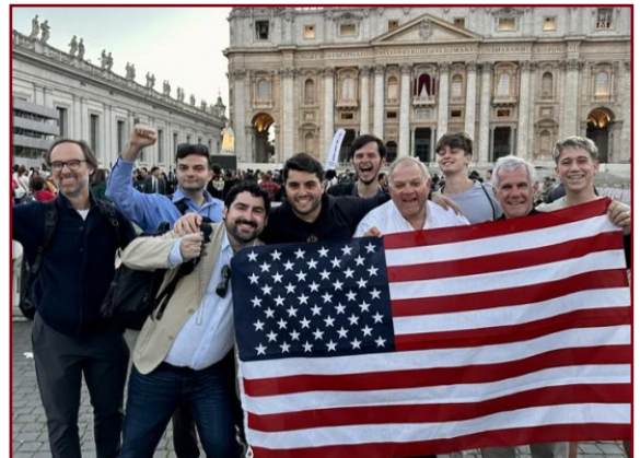
Americans gather in St. Peter's Square on May 8, 2025, to celebrate the election of Pope Leo XIV, the first pontiff from the United States.

(Fifty percent of this collection is sent to the USCCB for national Catholic television, radio, and other media and fifty percent is retained by our Eparchy for The Maronite Voice and other communication needs.)