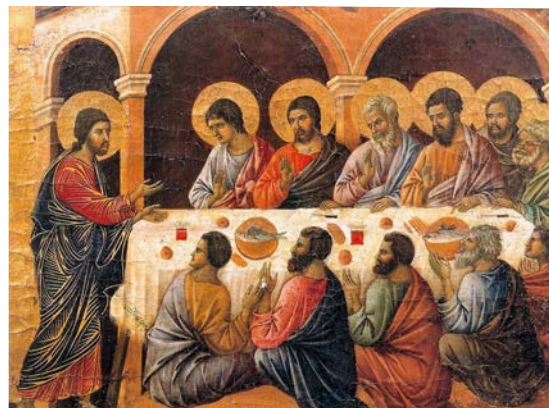
JESUS APPEARS TO THE APOSTLES AT TABLE. Duccio di Buoninsegna, c. 1308-1311, Sienna: Museo dell'Opera del Duomo.

me and see, because a ghost does not have flesh and bones as you can see I have." And as he said this, he showed them his hands and his feet. While they were still incredulous for joy and were amazed, he asked them, "Have you anything here to eat?" They gave him a piece of baked fish; he took it and ate it in front of them. He said to them, "These are my words that I spoke to you while I was still with you, that everything written about me in the law of Moses and in the prophets and psalms must be fulfilled." Then he opened their minds