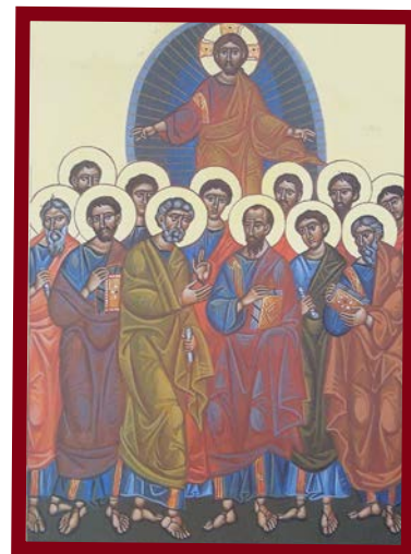
ORTHODOX ICON OF JESUS AND HIS APOSTLES.

When he had left, Jesus said, "Now is the Son of Man glorified, and God is glorified in him. (If God is glorified in him,) God will also glorify him in himself, and he will glorify him at once. My children, I will be with you only a little while longer. You will look for me, and as told the Jews, 'Where I go you cannot come,' so now I say it to you. I give you a new commandment: love one another. As I have loved you, so you also should love one another. This is how all will know that you are my disciples, if you have love for one another." This is the Truth. Peace be with you.