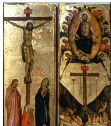
Two panels from a triptych. In the Last Judgment scene, Christ arrives in glory to judge the dead, who rise from their tombs expressing hope, awe, and fear. Jacopo del Casentino (1279-1358). Walters Art Museum, Baltimore

even the elect. Behold, I have told it to you beforehand. So if they say to you, 'He is in the desert,' do not go out there; if they say, 'He is in the inner rooms,' do not believe it. For just as lightning comes from the east and is seen as far as the west, so will the coming of the Son of Man be. Wherever the corpse is, there the vultures will gather. "Immediately after the tribulation of those days, the sun will be darkened, and the moon will not give its light, and the stars will fall from the sky, and the powers of the heavens will be shaken. And then the sign of the Son of Man will appear in heaven, and all the tribes of the earth will mourn, and they will see the Son of Man coming upon the clouds of heaven with power and great glory. And he will send out his angels with a trumpet blast, and they will gather his elect from the four winds, from one end of the heavens to the other.