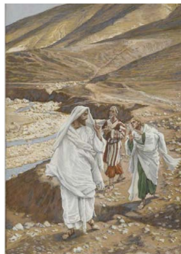
THE CALLING OF SAINT JOHN AND SAINT ANDREW (VOCATION DE SAINT JEAN ET DE SAINT ANDRÉ) From the series LA VIE DE NOTRE-SEIGNEUR JÉSUS-CHRIST 1886-1894 by James Tissot. THE Brooklyn Museum.

The Apostle said: The next day John again was standing with two of his disciples, and as he watched Jesus walk by, he exclaimed, "Look, here is the Lamb of God!" The two disciples heard him say this, and they followed Jesus. When Jesus turned and saw them following, he said to them, "What are you looking for?" They said to him, "Rabbi" (which translated means Teacher), "where are you staying?" He said to them, "Come and see." They came and saw where he was staying, and they remained with him that day. It was about four o'clock in the afternoon. One of the two who heard John speak and followed him was Andrew, Simon Peter's brother. He first found his brother Simon and said to him, "We have found the Messiah" (which is translated Anointed). He brought Simon to Jesus, who looked at him and said, "You are Simon son of John. You are to be called Cephas" (which is translated Peter). This is the truth. Peace be with you.