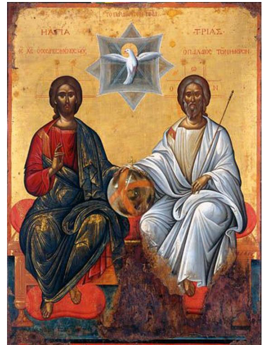
THE HOLY TRINITY. Between 1550 -1593. Athens: The Benaki Museum

heaven and earth, for although you have hidden these things from the wise and the learned you have revealed them to the childlike. Yes, Father, such has been your gracious will. All things have been handed over to me by my Father. No one knows who the Son is except the Father, and who the Father is except the Son and anyone to whom the Son wishes to reveal him." Turning to the disciples in private he said, "Blessed are the eyes that see what you see. For I say to you, many prophets and kings desired to see what you see, but did not see it, and to hear what you hear, but did not hear it."